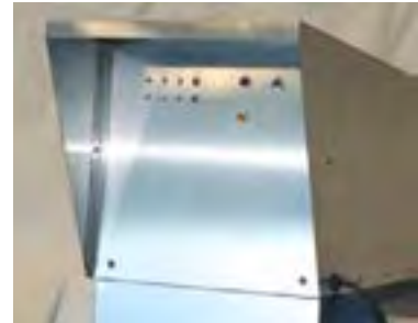
Lamp-out LED indicator lights, and air flow indication, are standard features on the BT Series control panel.