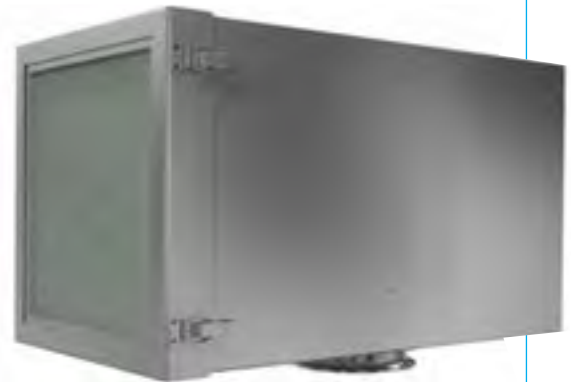
LTX Tank Vent

The LTX Series Tank Vent standard filter package includes two 10 micron electrostatic filters and one 0.3 micron HEPA filter. American Ultraviolet can also provide virtually any size and type of tank connection fitting for our tank vents.