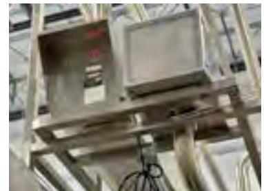
BT-8-120 Conditioner with LTX-14 Tank Vent